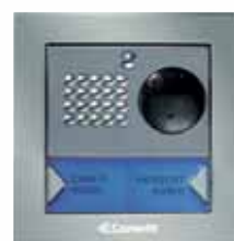
N° 1 art. 4876/BK