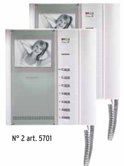
N° 2 art. 5701