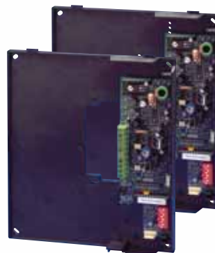
N° 2 art. 5714/K